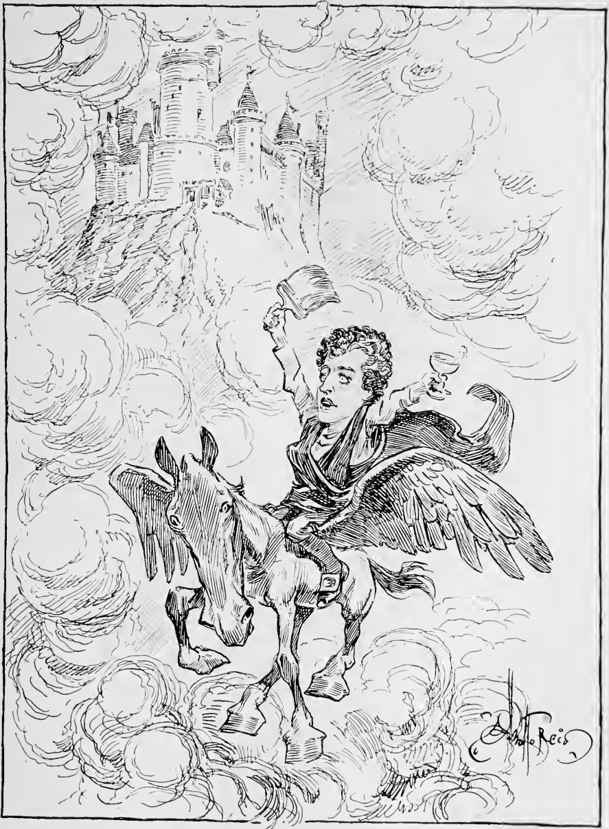
THE POET BYRON BUILDING CASTLES